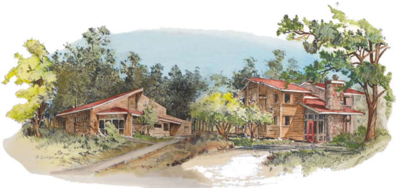
William Penn Mott Jr. Training Center